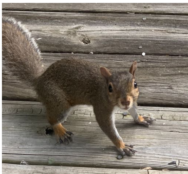
Visitors on my deck every morning.