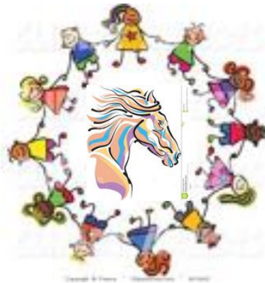
T-Shirt design in process for the local therapy riding group