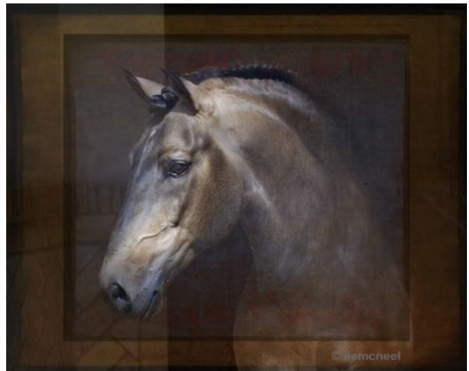
Revisiting some photos from my trip to Spain a couple of years ago