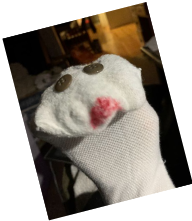
Sock puppet recently used in my FB video...

Send me social media size photos of what you are working on, or a description of what you are doing, and I will post one artist per month. Send to E7Aquila@aol.com I'll go first.